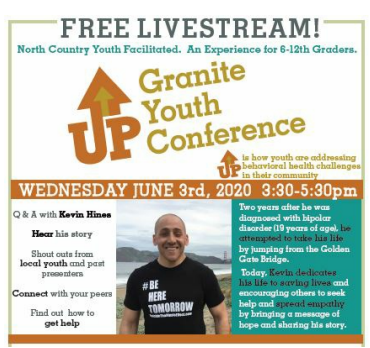
The 3rd Annual UP Granite Youth Conference is a livestreamed event on June 3 . Checkout the <u>UP flyer</u> for details.