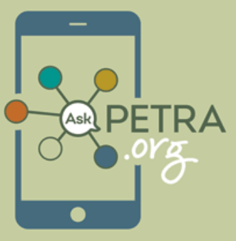
Look out for Part 2 of AskPETRA's unveiling: the website, <u>AskPETRA.org</u>, launches June 1!

Register to join the next virtual MRC orientation training on May 30: <u>IS 100:</u> <u>Introduction to the Incident</u> <u>Command System (ICS)</u>