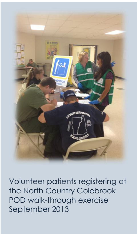
Volunteer patients registering at the North Country Colebrook POD walk-through exercise September 2013