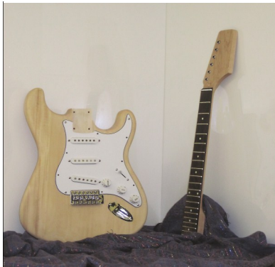
Electric Guitar Building

Monday through Friday 9 a.m. to 4 p.m. White Mountains Community College